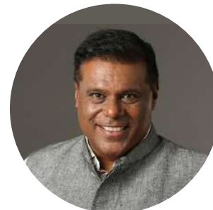
Ashish Vidyarthi National award winning Actor, Speaker, Founder at AVID MINER